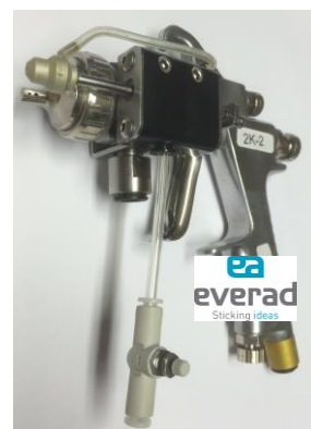
Concept of the co-spraying of both components Everad® TAC 2020 A + TAC 2013 B