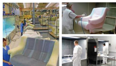
Example of application of Everad® 2C waterbased contact adhesive