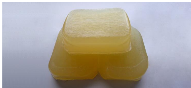
Everad ® HAP 3385 is available in packfree blocks for a easy handling to fill all types of melters