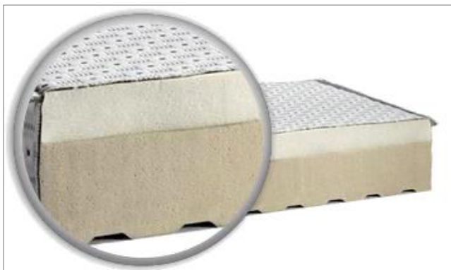
Everad ® HAP 3385 hotmelt adhesive enables bondings of various foams, latex and covers