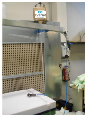
Cubibox system with gravity feed