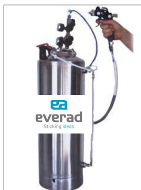
Under pressure pot application