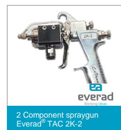
2 Component spraygun Everad® TAC 2K-2