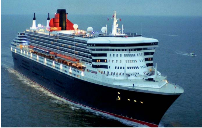
The interiors are fitted out with partitions made from sandwich or honeycomb panels to reduce weight.