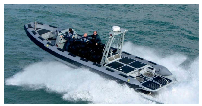
The bonding of semi-rigid boats calls for a high-performance Everad adhesive.

The Everad range comprises a wide choice of quality, ecofriendly adhesives and products suited to every application. We also develop new solutions together with you. We have a wide variety of technologies at our disposal for this purpose – water-based adhesives, reactive systems, hot-melt adhesives, heat-sealing films, and new-generation solvent-based adhesives. Together, we shall find ways of simplifying operations to optimise your processes and boost your production.