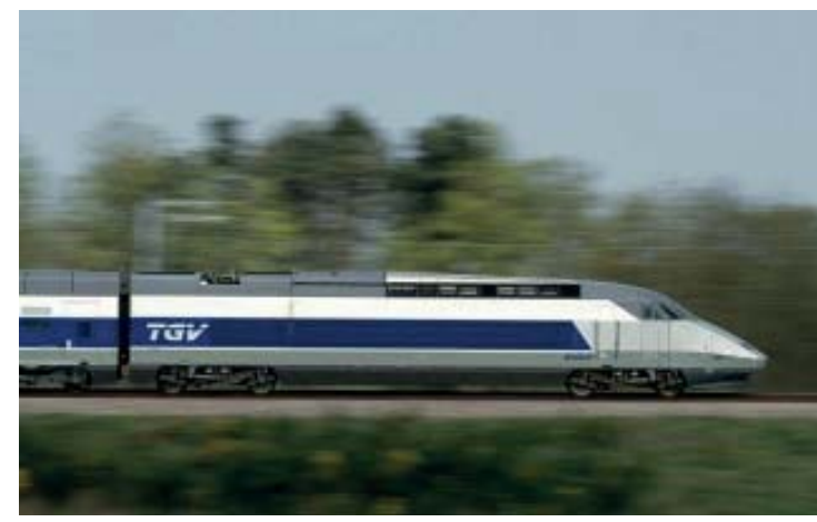
The design of modern means of transport calls for joints that are extremely resistant and elastic.

Depending on exact requirements, specific characteristics such as resistance to cold, heat, fire, weight or flexibility constraints or their application conditions can be accurately adjusted. Everad's skilled technicians provide innovative joining solutions.