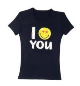
Films developed for flocking.

We look forward to acquainting you with new ideas.