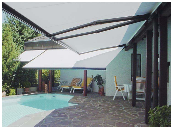
Heat-sealing films offer flexibility and durability.