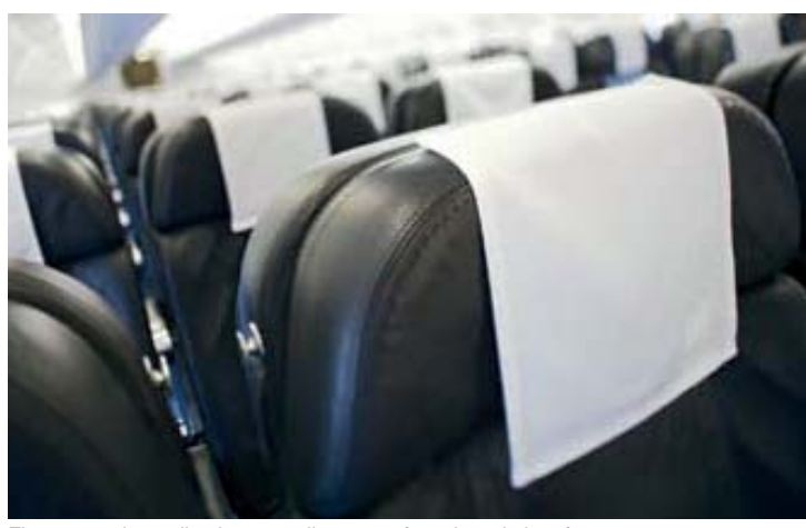
Flame-retardant adhesives contribute to safety aboard aircraft.