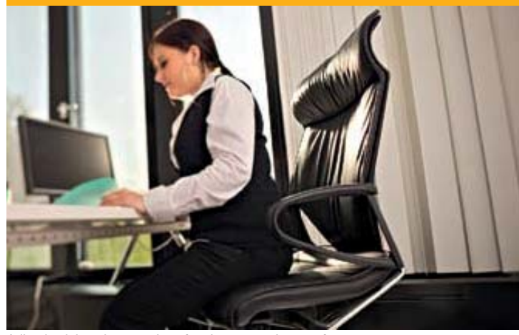
Adhesive joints that remain soft enhance seating comfort.

Depending on the application, specific characteristics such as heat resistance or spray patterns can be adjusted with great precision. Everad's experienced specialists are competent advisors when developing innovative solutions in the realm of foams.