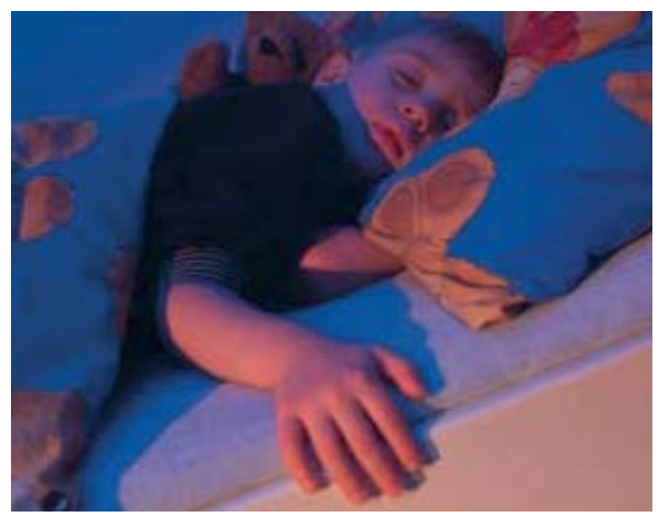
Everad dispersion and hot melt adhesives eliminate annoying squeaking effects in mattresses.

We look forward to acquainting you with new ideas. Contact us if you have questions concerning our innovative foam adhesives. Our answers will convince you.