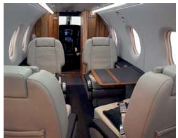
Interior trim and cockpit elements in PC-12 aircraft are bonded with our VOC-free contact adhesive.