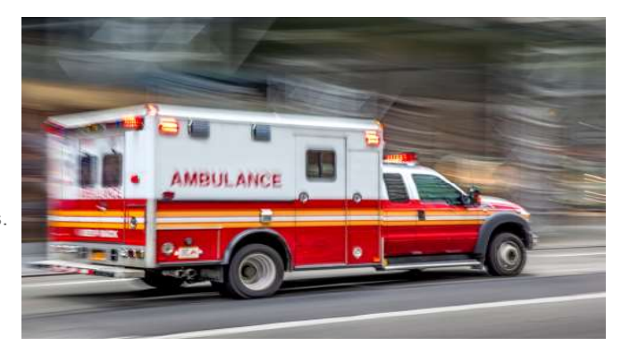
All types of vehicles use unsulations panels.

The Everad range comprises a wide choice of quality, ecofriendly adhesives and products suited to every application. We also develop new solutions together with you. We have a wide variety of technologies at our disposal for this purpose – water-based adhesives, reactive systems, hot-melt adhesives, heat-sealing films, and new-generation solvent-based adhesives. Together, we shall find ways of simplifying operations to optimise your processes and boost your production.