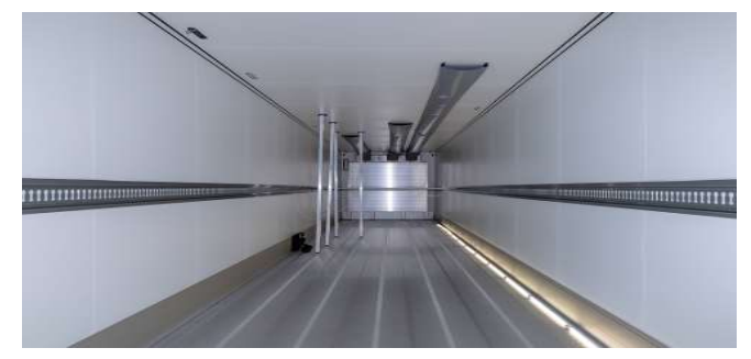
The manufacture of trucks requires very resistant glues for both the body and the floor.