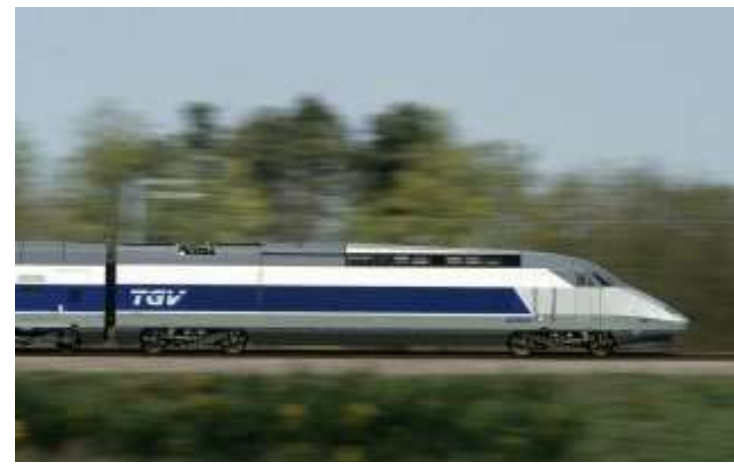
The design of modern means of transport calls for joints that are extremely resistant and elastic.