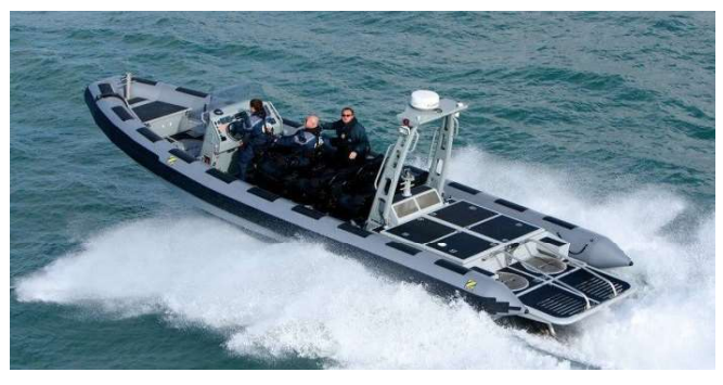
The bonding of semi-rigid boats calls for a high-performance Everad adhesive.