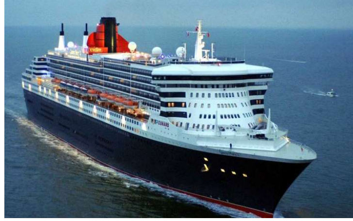
The interiors are fitted out with partitions made from sandwich or honeycomb panels to reduce weight.