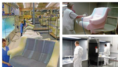
Example of application of Everad® 2C water-based contact adhesive