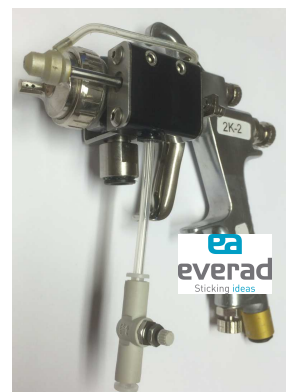
Concept of the co-spraying of both components Everad® TAC 2014 A + TAC 2013 B