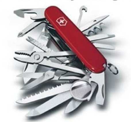
Everad® Green TAC 3010 A+B Prime : Simplify your life, push the limits!