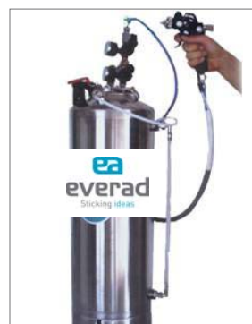
Under pressure pot application