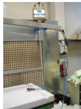
Cubibox system with gravity feed