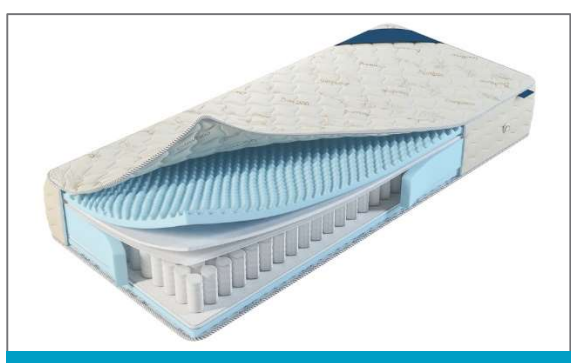
Versatility to bond all parts of spring mattresses