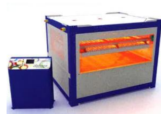
Sahara infrared drying machine from Quarrata Forniture

After the application of Everad® TAC 4111.5 IR by the roll machine, the layer passes under the infrared lamps that quickly dry the adhesive so that the mattress itself can immediately be pressed, packed and even rolled up for packing, in impressively short times with no waiting period.