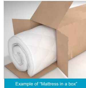
Example of "Mattress in a box"

Its special formulation gives it very high performance at low grammage, with greater adjustment flexibility (IR exposure time, open time).